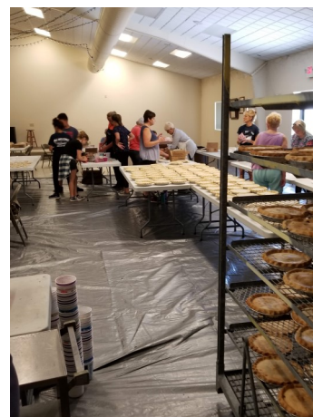
Blueberry pie making at the Moose Lodge