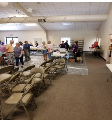
Setting up at the Moose to bake the blueberry pies.