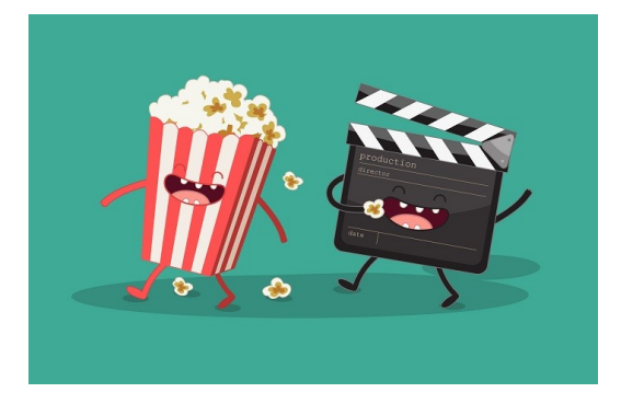
Family Fellowship Night -Pizza–Movie–Popcorn

Join us <u>Sunday, May 5th at 5 p.m.</u> for a fun evening! We'll have pizza and salad first. Then we will sit back, enjoy some popcorn and a movie.