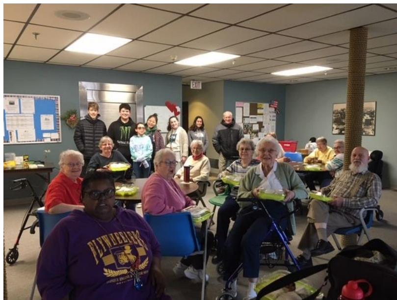
Youth and residents at one of our local senior citizen facilities delivering containers of cookies.