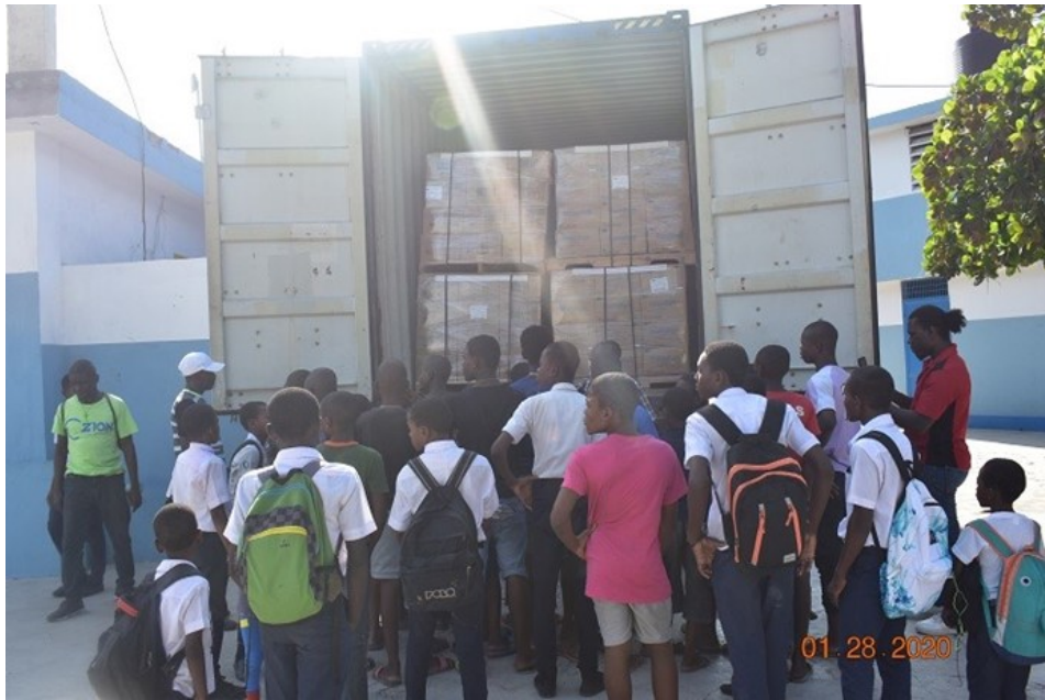
Boys unloading the boxes of food that were shipped from Illinois to the orphanage.