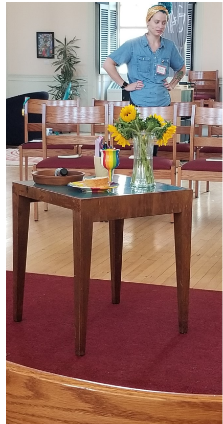
Pastor Sara of Old West Church