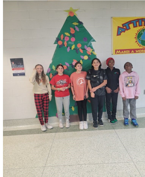
The Food Pantry recently received donations from Baseline Middle School. Here are some of the students who helped organize the event.