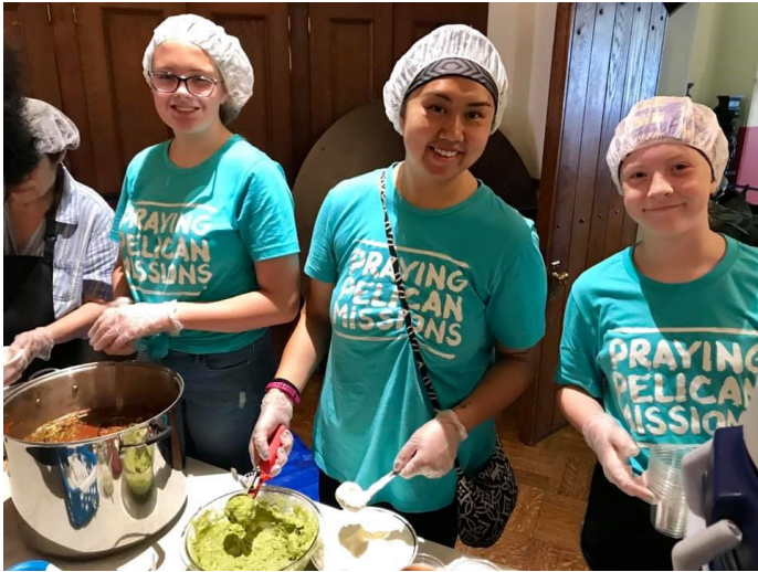
Art lunch—girls serving lunch

On both days we handed out water and food to homeless people or others on the street. We experienced people who didn't want to talk to us to many who were very grateful and thankful for our donation.