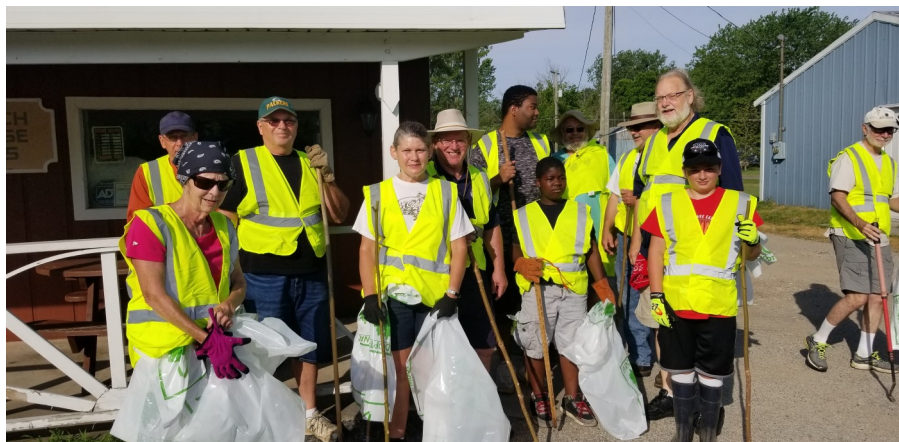
Highway Clean up Crew