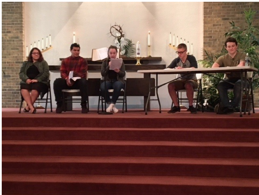
High School class practicing skit for worship.