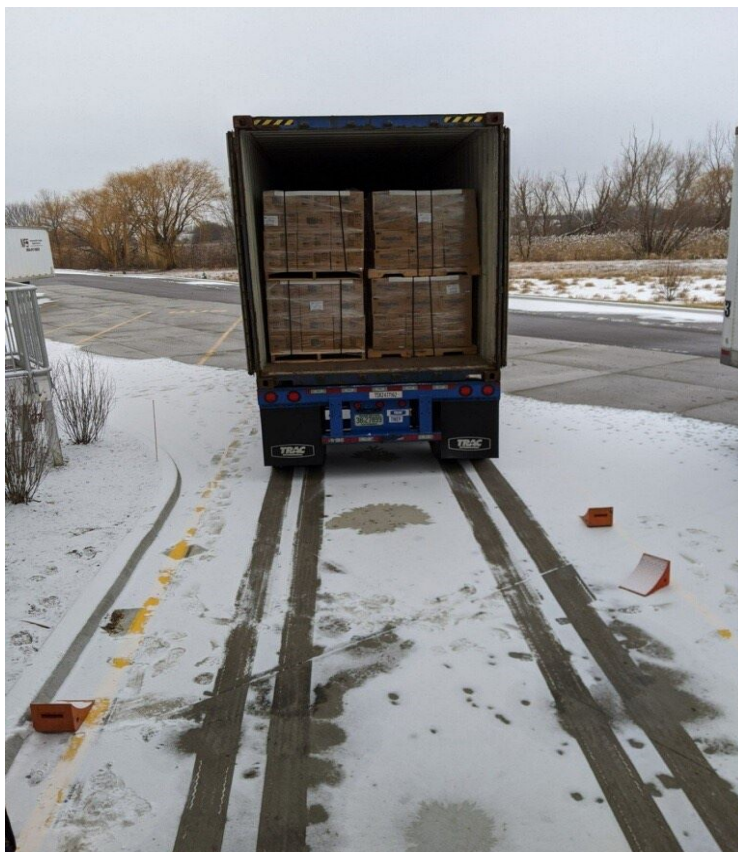
Food Truck being loaded in Schaumburg, IL